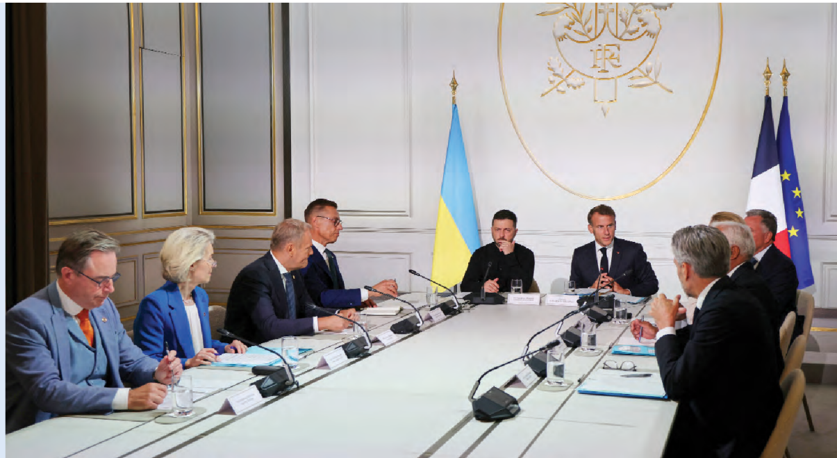
Belgium's Prime Minister Bart De Wever, European Commission President Ursula von der Leyen, Poland's Prime Minister Donald Tusk, Finland's President Alexander Stubb, Ukraine's President Volodymyr Zelenskyy and French President Emmanuel Macron speaking during a summit on Ukraine

Although Trump said he is "disappointed" in Russian President Vladimir Putin and issued several threats to try to cajole him into negotiating an end to hostilities, none have worked. At a meeting with Putin in Alaska in August, Trump failed